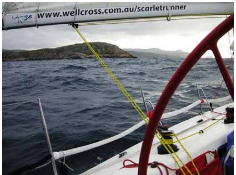
The view from Scarlet Runner as she makes her way to Sydney

The final day, Sunday was a bit of an anti-climax. We were off Bate Bay, when boat speed was dropping below 5kts so on went the motor and we eventually reached Sydney and tied up at CYCA about 5.30pm. Over drinks later, we debriefed – the first three days of the delivery could have been a dress rehearsal for the upcoming Sydney to Gold Coast race which was to start in two weeks time.