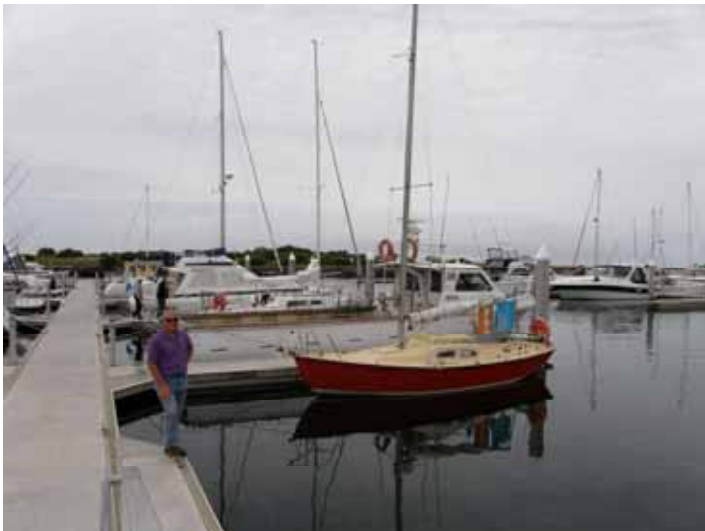
Above and below: Paramour at Queenscliffe marina.

Paramour recently had a long weekend away from her mooring. She started out on Saturday morning with the fleet racing to Mornington. The only Bluebird in the fleet and the smallest, she came in at 18th out of 34 starters. She didn't get line honours, but nor was she last across. After a night at Mornington jetty, the next day, following a bit of indecision as to whether Queenscliffe or Blairgowrie would be the destination choice, she headed for Queenscliffe. Motor sailing most of the way, she arrived mid afternoon at the new marina. As you can see from the pictures she fitted very easily into her berth. The Queenscliffe marina doesn't have any old world charm about it, but it does have good facilities and is an easy walk to town. With a forecast for unpleasant weather on the Tuesday (Cup Day), her crew turned her towards Hobsons Bay on Monday morning. Unfortunately there was little breeze so once again the outboard came out and so did the ear plugs and we made our way up the bay. The wind kicked in for the final hour and Paramour sailed back to her mooring refreshed from her little tour.