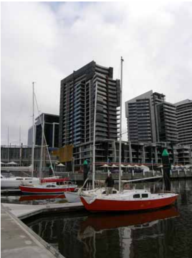
L to R: Nunyarra, Shadow and Manjimup (Paramour hidden by Nunyarra) berthed at Docklands.

The overnighter to Docklands was held after the sail past at the HBYC Open Day on October 3 rd . Four yachts (Paramour, Manjimup, Nunyarra and Shadow) headed up the river and had a really enjoyable evening courtesy of the Docklands Marina complex at the Waterfront City Marina. It is extremely good value at $35 per boat per night with a terrific set up: good, safe mooring and really well appointed facilities including bathrooms, kitchen, laundry, outdoor deck with a gas barbeque, internet (free) and a large lounge with plasma TV. We had a pleasant evening on the deck enjoying gourmet pizza from the nearby Mecca Bah restaurant and a bottle or two of good wine.