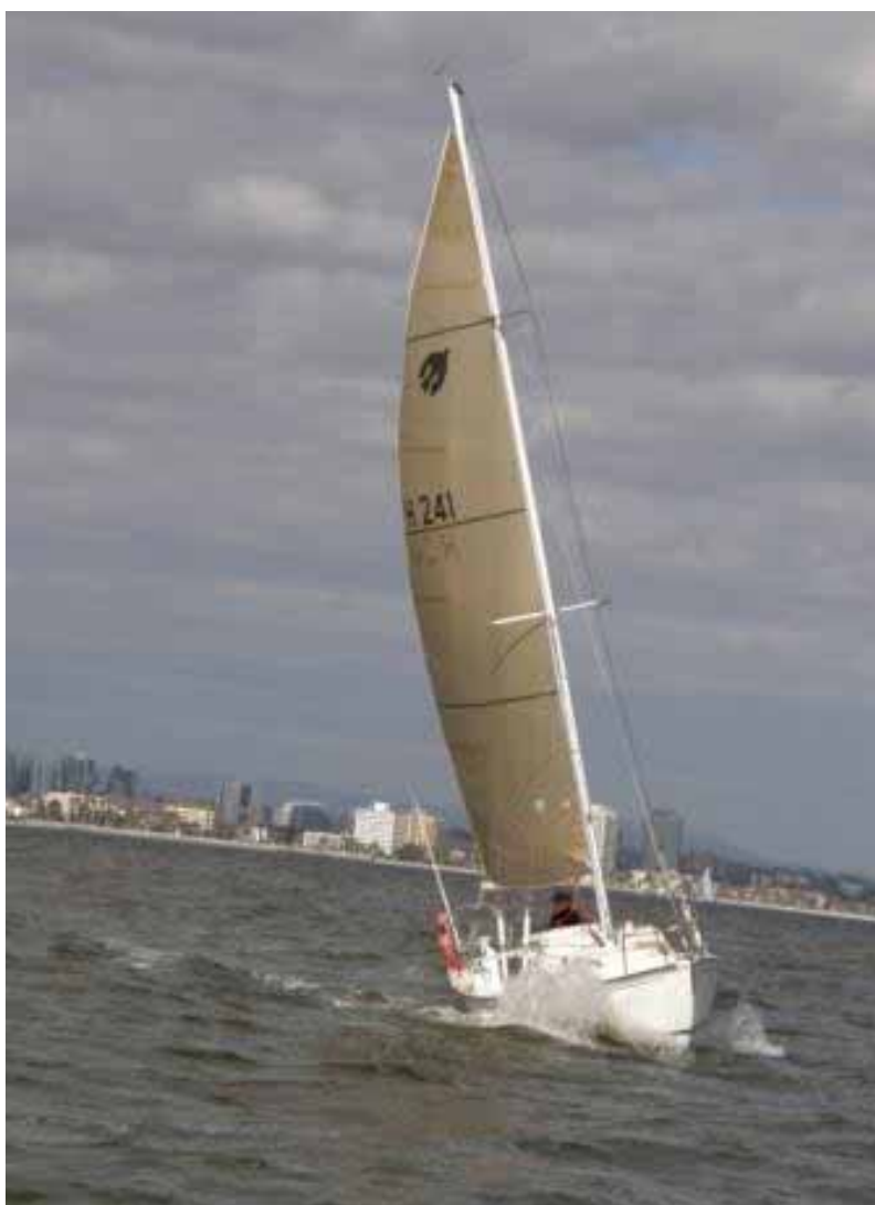
Shadow makes her way to the river for the Docklands overnighter, having participated in the HBYC opening day sail-past.