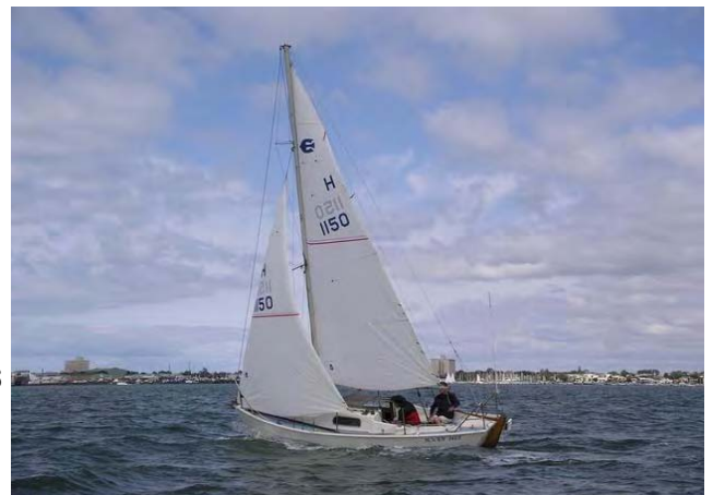
Moody Blue Race 3