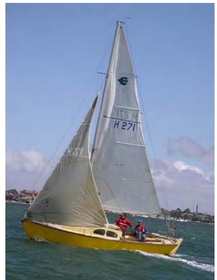
Warranilla Race 2

Congratulations again to Ivan on winning, to the minor place getters and to all the Bluebirds who competed. It was a great series - no races had to be cancelled and there was plenty of wind in each race. Everyone was up there at some stage with 5 different winners from the 5 races (Paramour won 2 but there were 2 winners in the last race - see above).