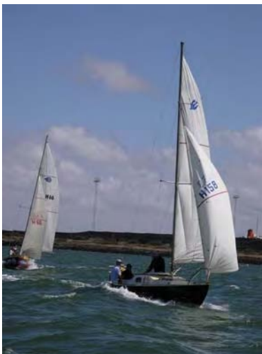
Paramour behind Tandeka before the start of Race 2