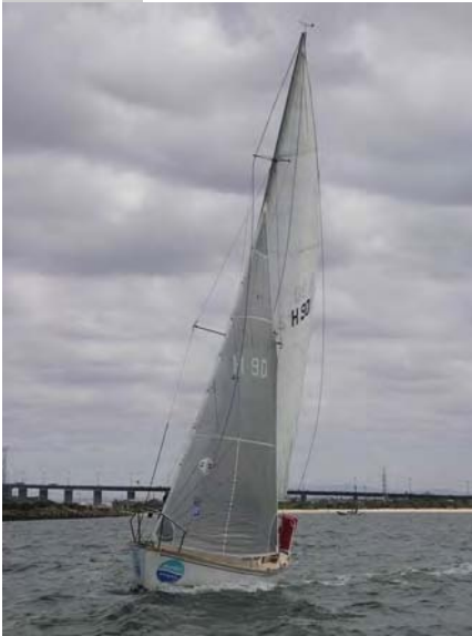
Secret Race 3

Bounty, ahead of Moody Blue, followed by Paramour, Jay, then Shadow, with Secret keeping look-out at the rear to ensure there were no casualties along the way - thanks Jock. There was only about 7 minutes separating 1st from 5th - that's around a 2% difference, showing again the closeness of the competition.