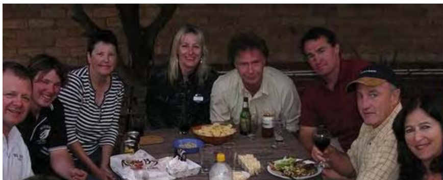
A few of the Bluebirders and families enjoying themselves at the 2006 end of year festivities.

It was also noticeably easy to retrieve a crew member back aboard a boat with no staunchions or lifelines. ( Eds note: Doesn't it also go then, that where a boat is fitted with staunchions and lifelines, it is probably not so easy to lose someone over the side! )