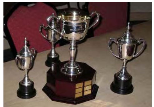
Bluebird Cup trophies – Be in it to win it for 2007