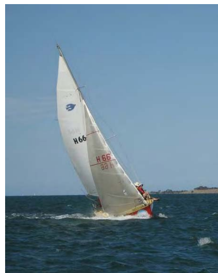
Paramour approaching the finish line at Geelong.