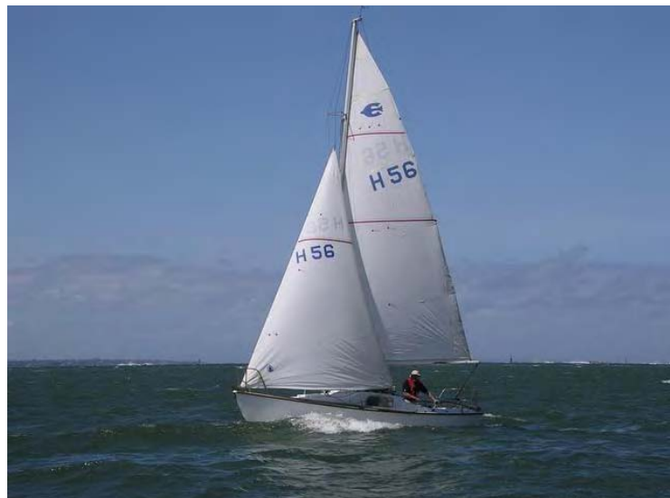
Bounty preparing for the start of Race 2 of the 2007 Bluebird State Titles.